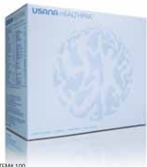
ITEM# 100 AUST L 163348